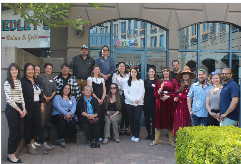
Group photo from Mentorship Launch day, April 2025.

The Network celebrated the official launch of the Mentorship Program in late April in North Vancouver! We were honoured to have the Squamish Ocean Canoe family share their cultural teachings, songs and dances with us, especially as a Host Nation who have stewarded those lands and waters for generations. We were also very grateful to the Squamish Elders who joined us for lunch and sharing on mentorship in the afternoon.