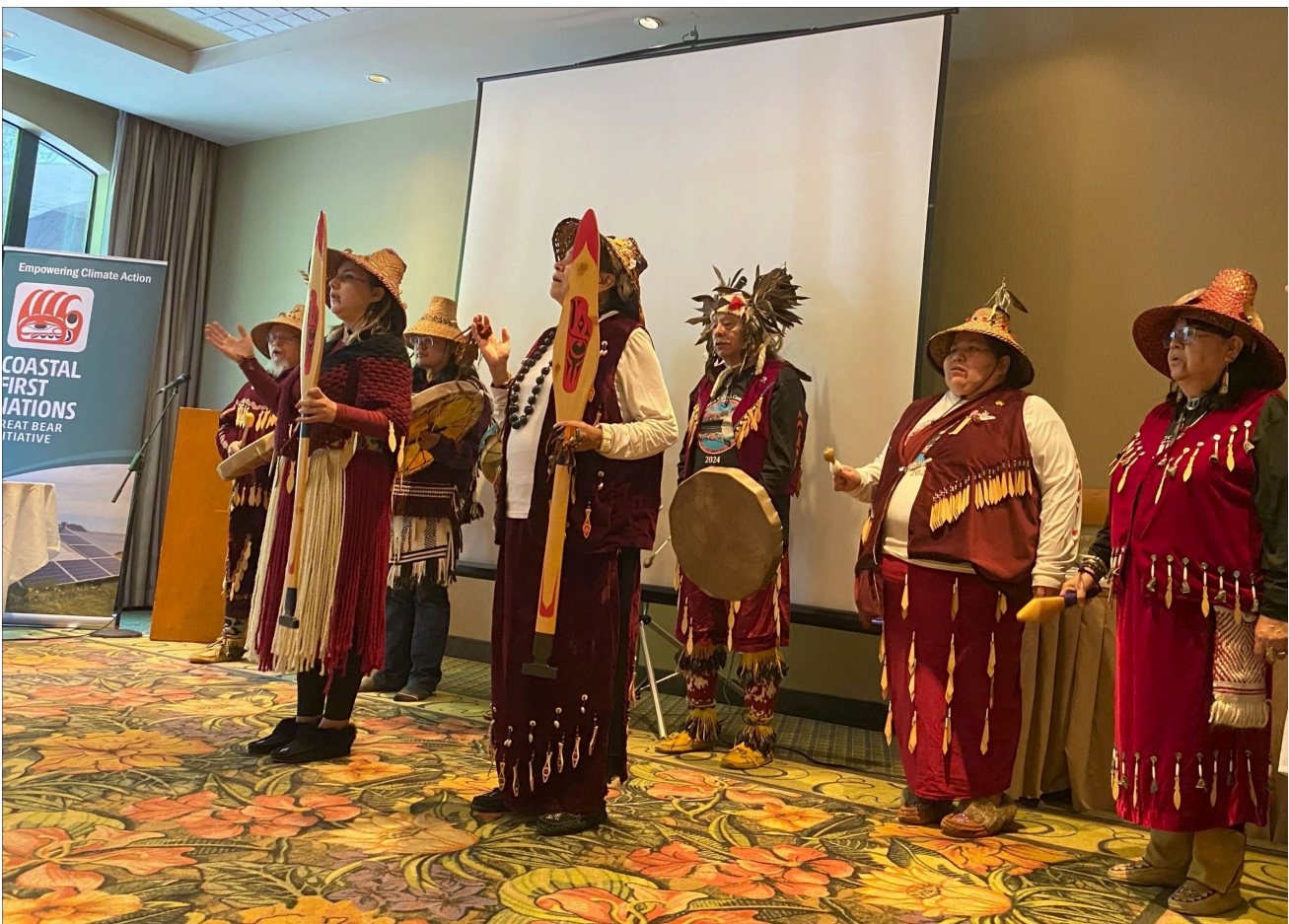
Members of the Squamish Ocean Canoe Family, April 2025.