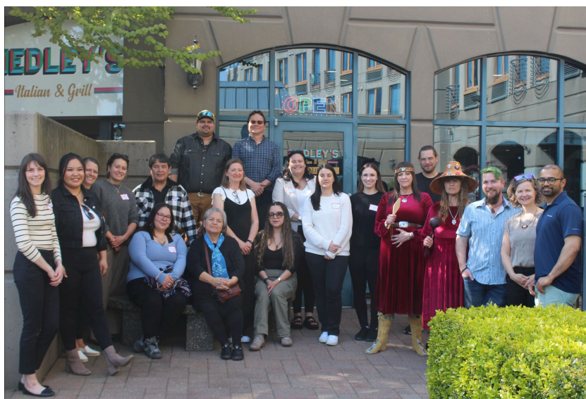
Group photo from Mentorship Launch day, April 2025.

The Network celebrated the official launch of the Mentorship Program in late April in North Vancouver! We were honoured to have the Squamish Ocean Canoe family share their cultural teachings, songs and dances with us, especially as a Host Nation who have stewarded those lands and waters for generations. We were also very grateful to the Squamish Elders who joined us for lunch and sharing on mentorship in the afternoon.